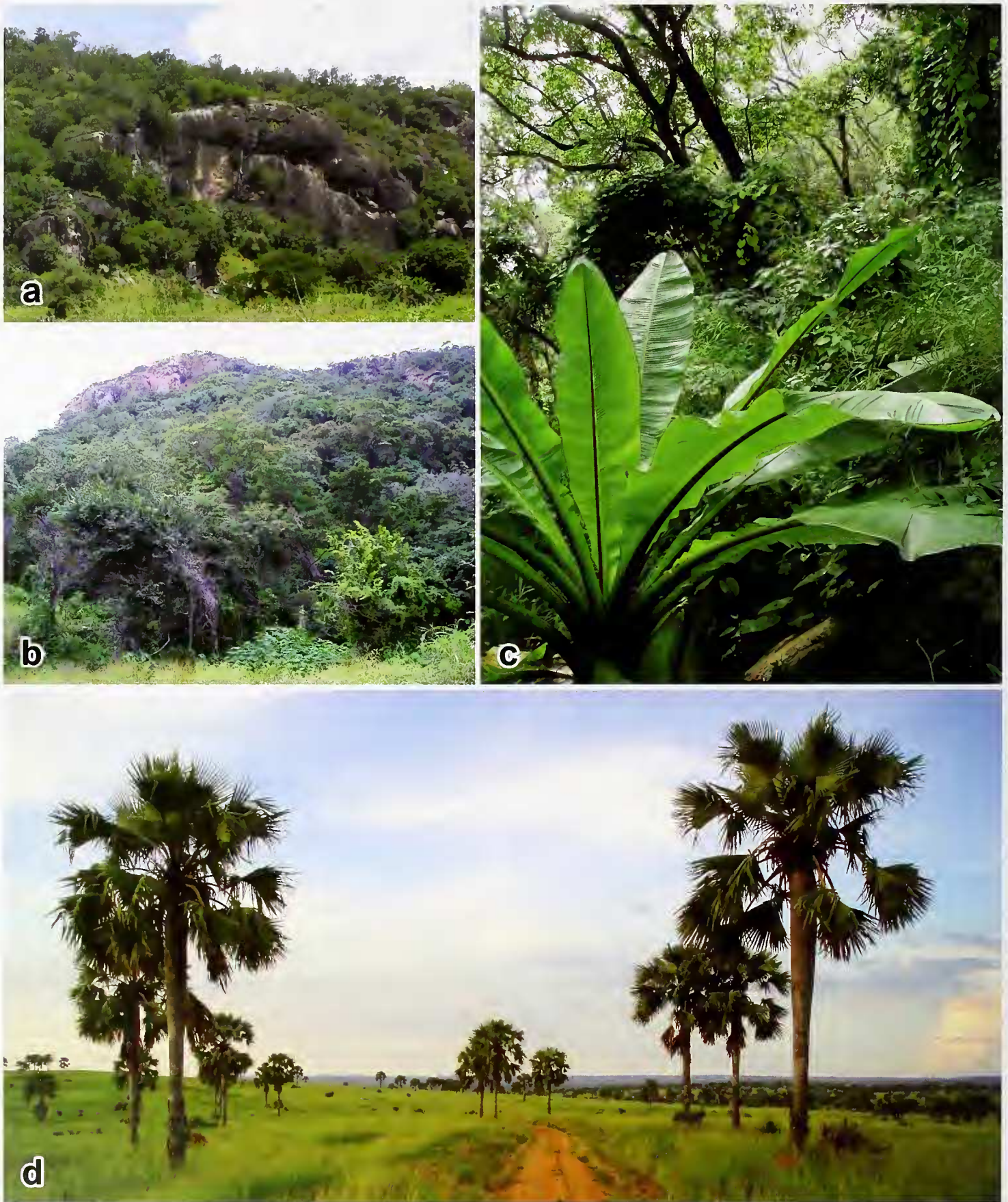
Fig. 1. Landscape and vegetation of the Mt. Otzi and adjacent areas. Fig. 1a. Rocky outcrops in Ubbi village on the foot of Mt. Otzi. Photograph A. D. Mihalca. Fig. 1b. Forest patch on the Mt. Otzi top plateau with an emergent rocky peak in the background. Photograph M. Jirků. Fig. 1c. Interior of the Mt. Otzi forest showing relatively open canopy and distinct Afromontane floristic element, the false banana of the genus Ensete in the foreground. Photograph M. Jirků. Fig. 1d. Palm savanna south of the Mt. Otzi region in the Murchinson Falls NP, Uganda. Photograph M. Jirků.